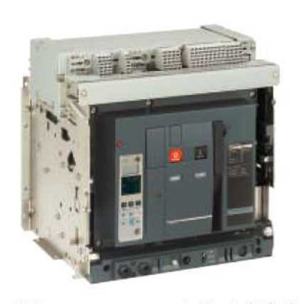
Masterpact NW 800 to 4000 A