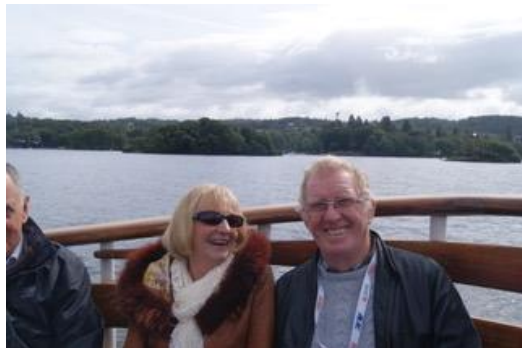
The AUE Retired Group's Excursion on Lake Windermere