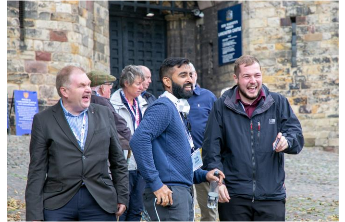
Visit to Lancaster Castle – One of 3 Excursions on Wednesday afternoon